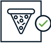
PIZZA BOXES Remove food, pizza savers (pizza tables), and liners